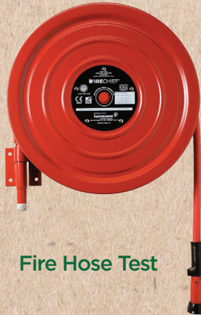
Fire Hose Test